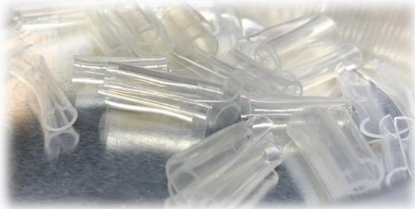
Figure 2: PET sample without discolouring after roasting (test passed)