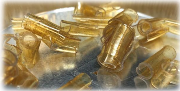
Figure 3: PET sample with discolouring by remaining adhesive